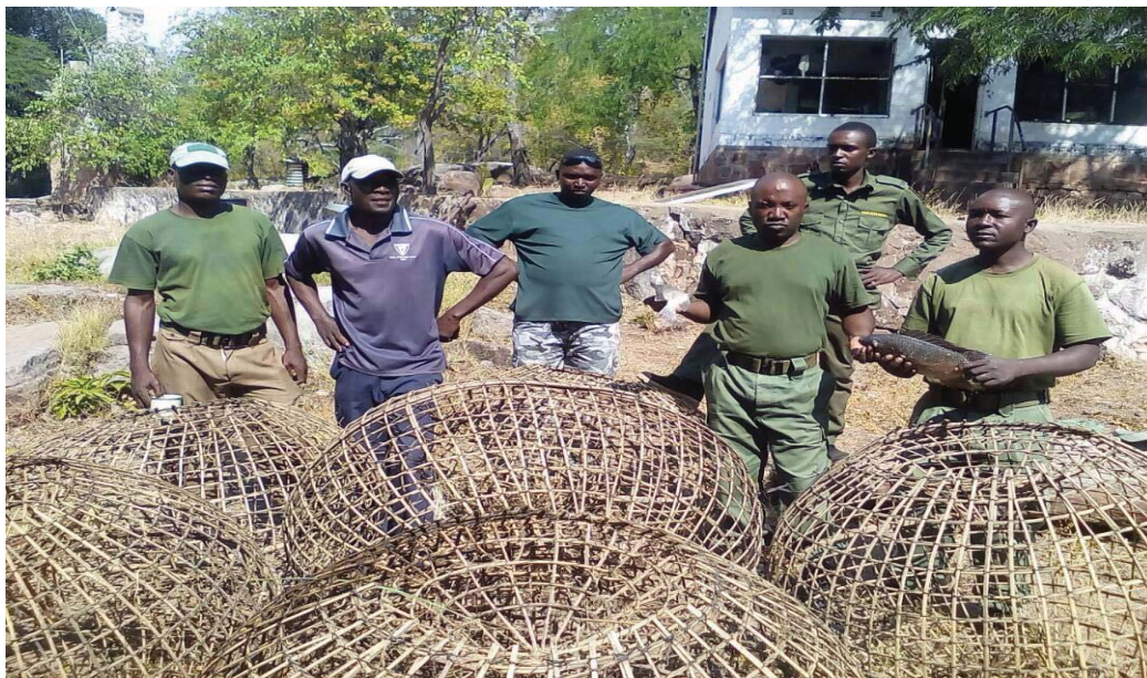
Fish traps – Zambezi River 2017

(Funnily enough large gauge holes & eco friendly - just placed in wrong country!)