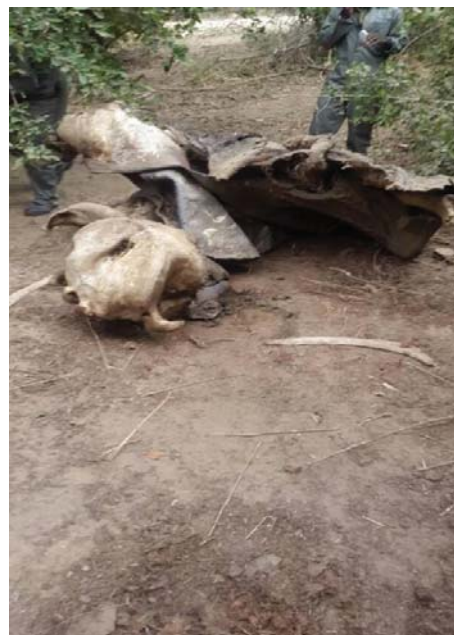
One bull and one cow – Yirira river 2017