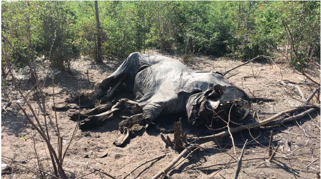
Ward 1 – elephant cow

of hunters also decreases – this has always been and will continue to be the danger time for all poaching.