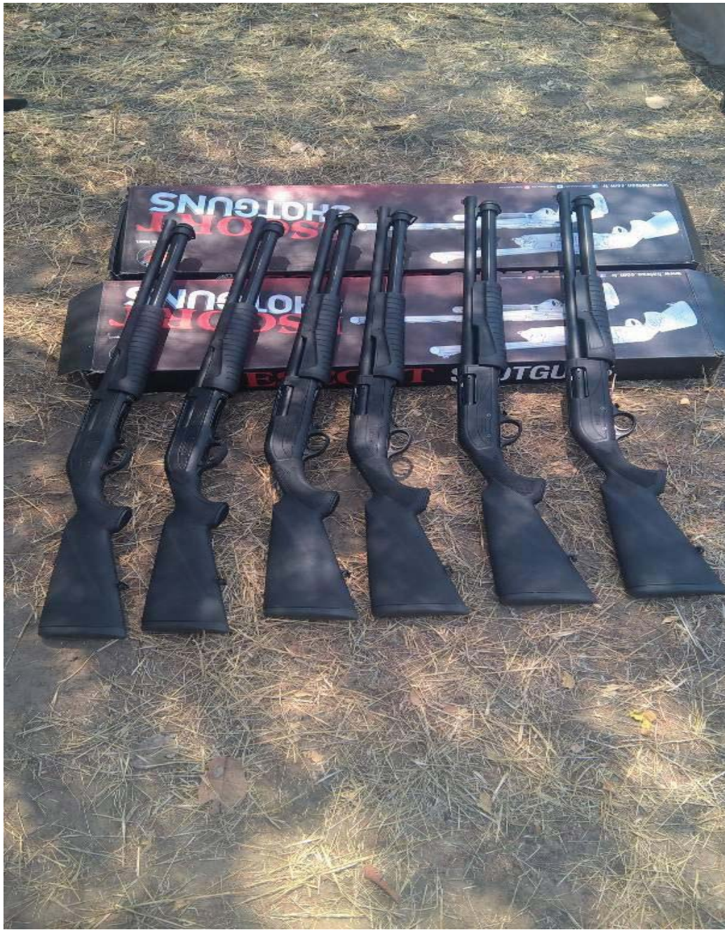
Aimguard shotguns x 6 per kind favor of a young Harare based hunter