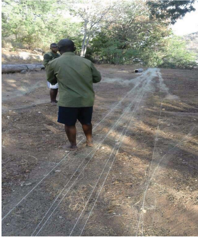
Measuring nets – note the fine gauge (No good they kill everything)