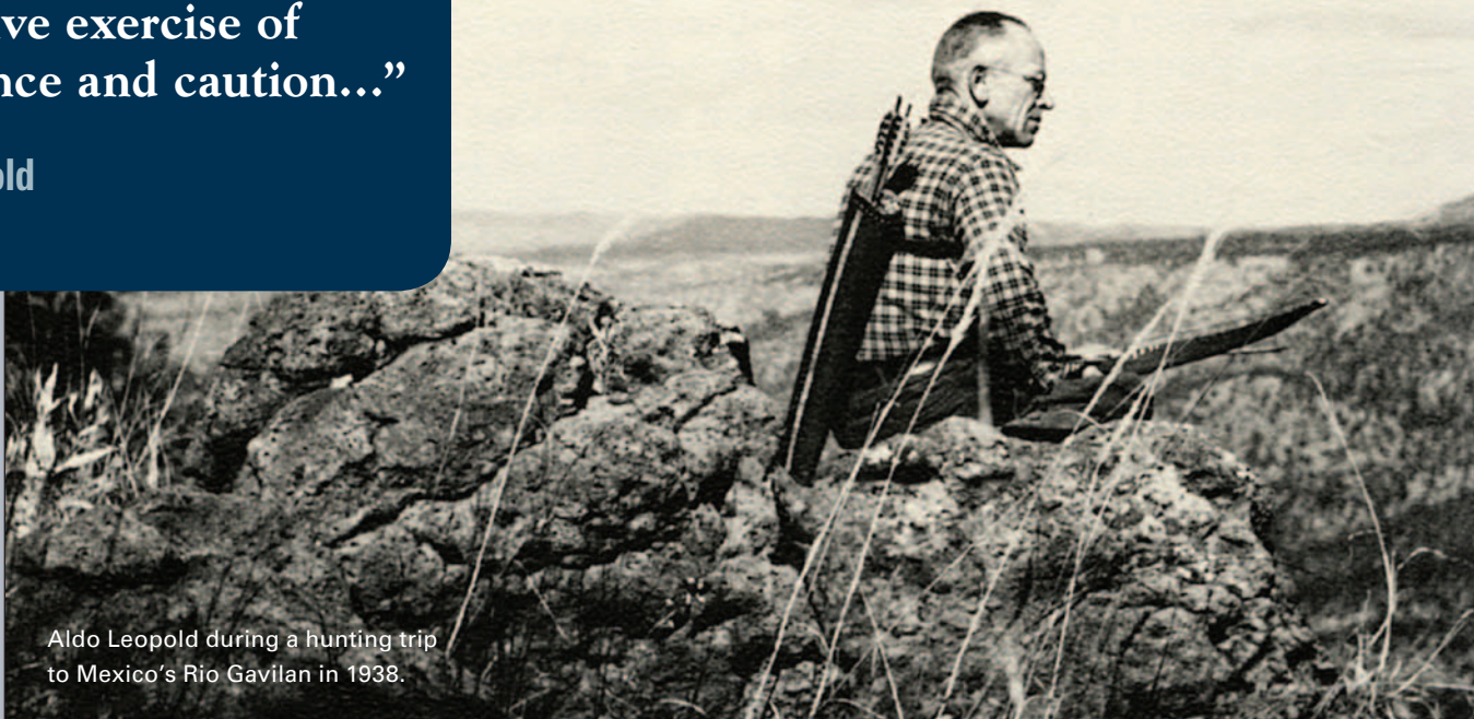
Aldo Leopold during a hunting trip to Mexico's Río Gavilán in 1938.