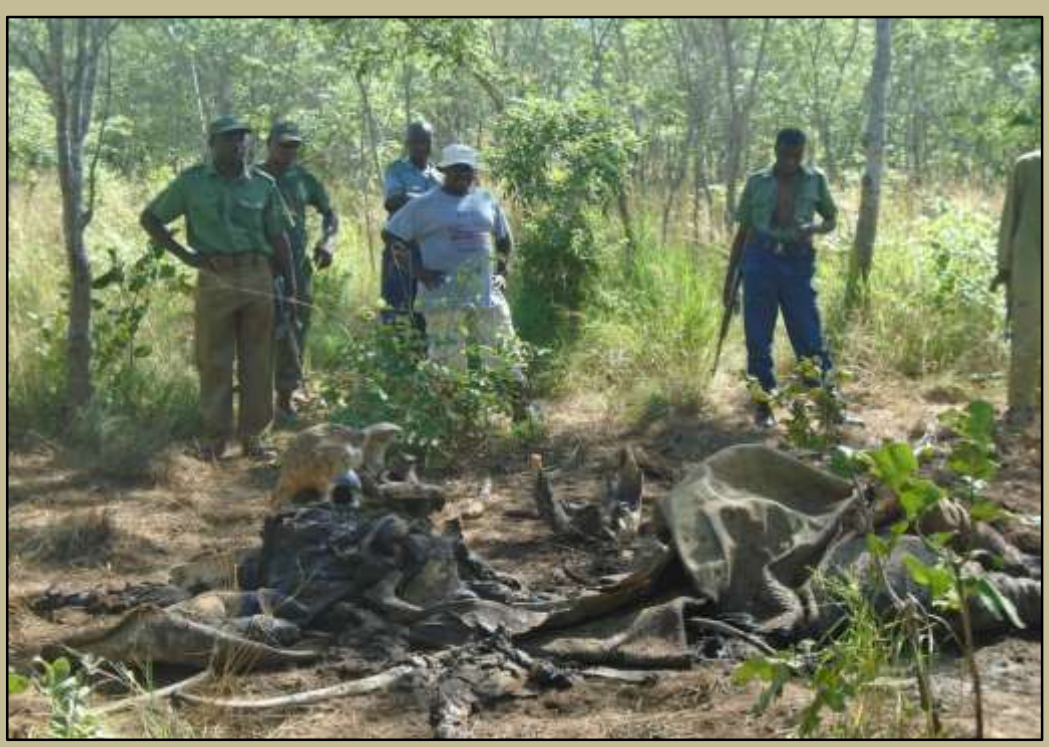
*** The poached elephant***