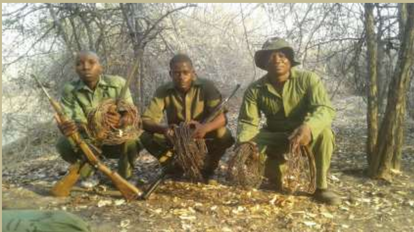
*** A typical haul of snares***