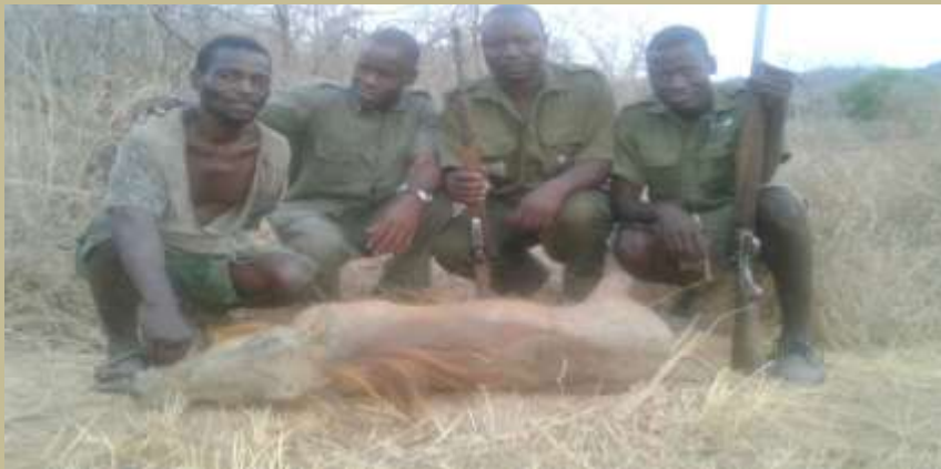
***DAPU call sign posing proudly with "their" poacher and "his" warthog! ***

*** It is clear to see the decline in poaching during the hunting season and also ... the impending increase in poaching activity as hunting slows down and we head towards Christmas. ***