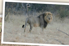
Surveying and aging of leopards and lions