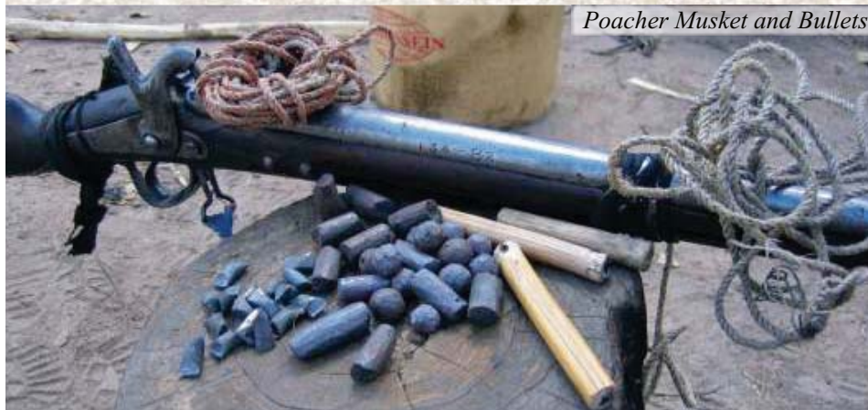
Poacher Musket and Bullets

4. Contact details About Cullman & Hurt Staff News Special Thanks