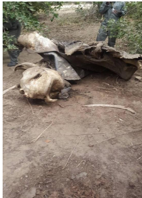
One bull and one cow – Yirira river 2017