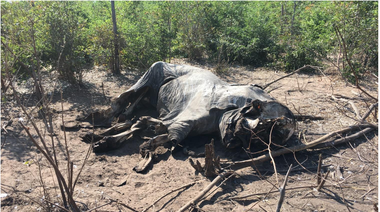
Ward 1 – elephant cow

of hunters also decreases – this has always been and will continue to be the danger time for all poaching.