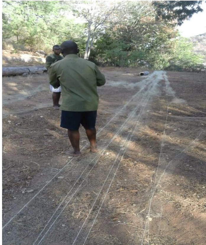
Measuring nets – note the fine gauge (No good they kill everything)