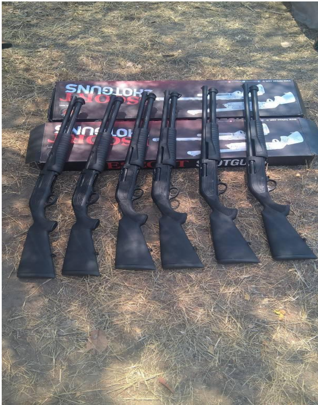
Aimguard shotguns x 6 per kind favor of a young Harare based hunter