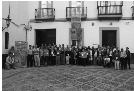
Attendees at the International Expert Workshop on Non-Detriment Findings for hunting trophies of CITES African Species.

According to the organizers, the workshop was intended to "foster close collaboration between scientific authorities from both exporting and importing countries in relation to the formulation of CITES Non-Detriment Findings (NDFs) for hunting trophies of certain African species..." However, one of the workshop's objectives was also to "elaborate draft guidance on best hunting management practices and NDF making for the target African species." (These species included lion, leopard, cheetah, elephant, rhino and hippo.)