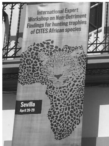
Spain's CITES Scientific Authority organized a workshop that sought to standardize practices for Non-Detriment Findings across Africa regardless of key differences in range nations.

South Africa employs a completely different, privatized and decentralized model. Privately-owned habitat is approximately three times larger than national and provincial parks. Privately-owned game populations are three times larger than the game populations on state land. Wildlife management decisions are largely made by the landowner, in accordance with provincial and national law. Almost all hunting takes place on private ranches and is overseen by provincial authorities. The landowner is the primary beneficiary of hunting revenues and funder of anti-poaching and management costs. Local communities play a reduced role.