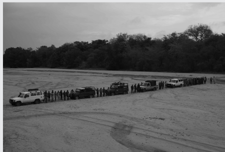
A lion survey team in the Selous Game Reserve.